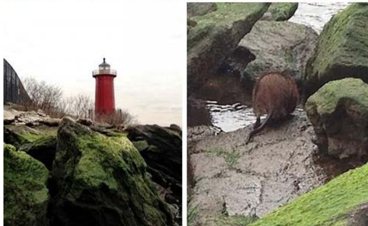
A muskrat is spotted at the Little Red Lighthouse under the George Washington Bridge.