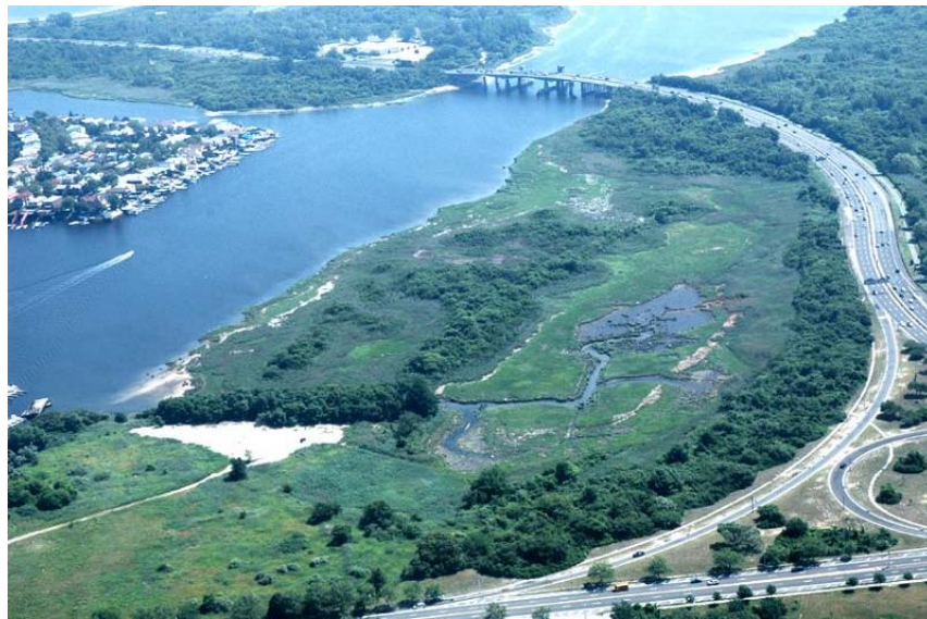
Aerial view of Four Sparrow Marsh.

In September, commercial development plans proposed for land adjacent to Brooklyn's Four Sparrow Marsh were withdrawn.