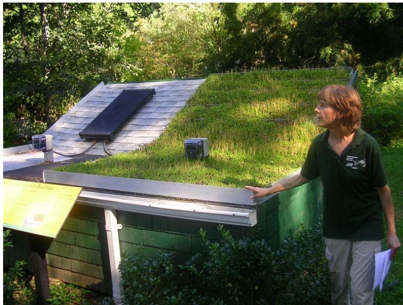
A model "green roof" at the Greenburgh Nature Center in Scarsdale, NY