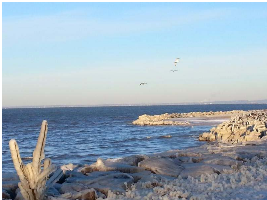
Officer's Row Beach and frozen spartina in Sandy Hook.

Treasures abound along our beaches in winter, so let's all get out there to see what we can find!