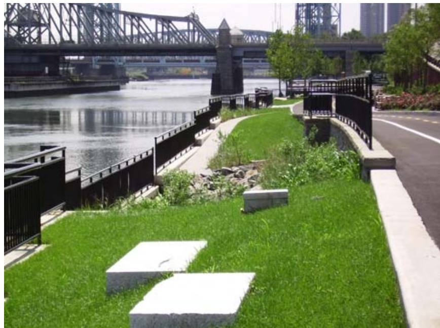
The shoreline at Harlem River Park was designed with ecological as well as public access and navigation considerations in mind

Simultaneously, the Metropolitan Waterfront Alliance is working on developing Waterfront Edge Design Guidelines (tentatively termed "WEDG") for the region, taking inspiration from LEED-style guidelines that encourage good design that, in this case, would take into account the many waterfront uses of the harbor as well as ecological considerations. NY-NJ HEP staff are engaging in this effort and will be working with MWA to ensure that knowledge gained through the Program's assessment protocol project will be used to inform these guidelines.