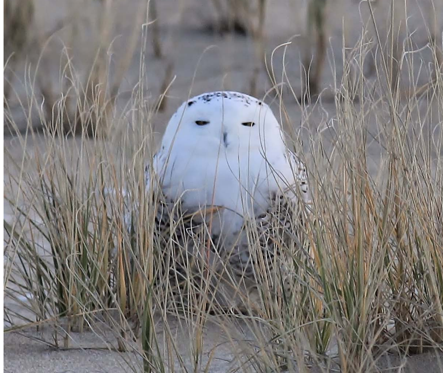
Arctic snowy owl at Sandy Hook before Thanksgiving.

Thousands of people visit New Jersey's coastal shores each year to enjoy all that they have to offer. Beach bathing, boating, water sports and boardwalk fun are usually on the agenda and are enjoyed by many during the warmer months. As the frost settles in and the days get shorter, fewer visitors are attracted to the beach. Yet the colder months can offer interest and beauty to anyone willing to venture outdoors when Old Man Winter is calling.