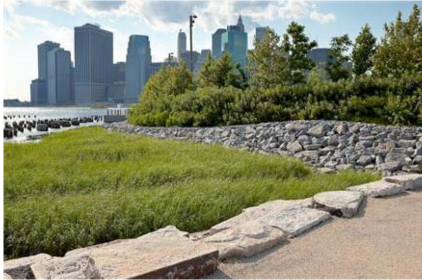
Shorelines in our estuary vary widely, but there is little known about the habitat quality associated with various types

The New York-New Jersey Harbor & Estuary Program has selected a team of researchers to move forward with a new project to study our urban shorelines.