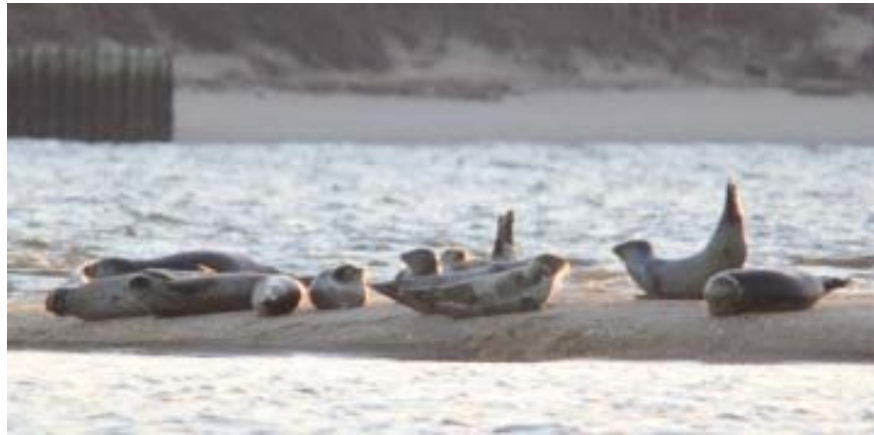
Harbor seals hauled out to rest at Sandy Hook.

Birds are plentiful at the shore in winter. Deciduous plants drop their leaves when diminished sunlight reduces their chlorophyll but the evergreen foliage of coastal Eastern red cedars and American holly offers a safe haven for crossbills, cardinals and sparrows, their "peeps" and "squeaks" carried on Arctic winds. Estuary-dwelling diamondback terrapins hibernate in benthic mud while above them bay waters team with grebes, scaup, buffleheads, mergansers, and brant that spend their days fishing, foraging and roosting. Hundreds of other avian species can be spied with many visitors traveling from as far away as Arctic regions and Europe so be sure to bring along your handy field guide.