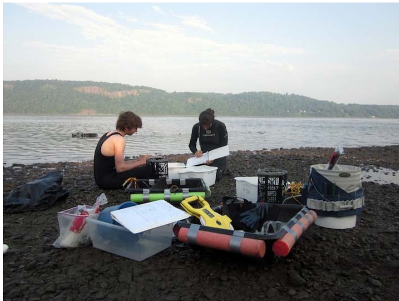
Monitoring oyster growth and survival at Hastings-On-Hudson. This is one of six pilot reefs installed by the Oyster Restoration and Research Project (ORRP) to help bring back oysters to our estuary.