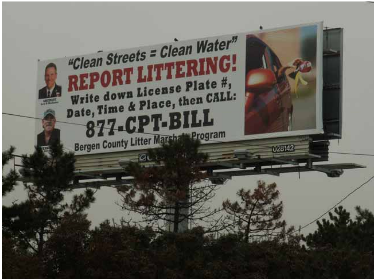
Billboard on Route 120