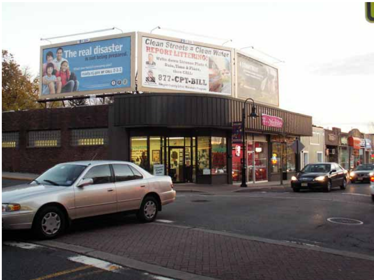
Billboard on Washington Avenue in Bergenfield