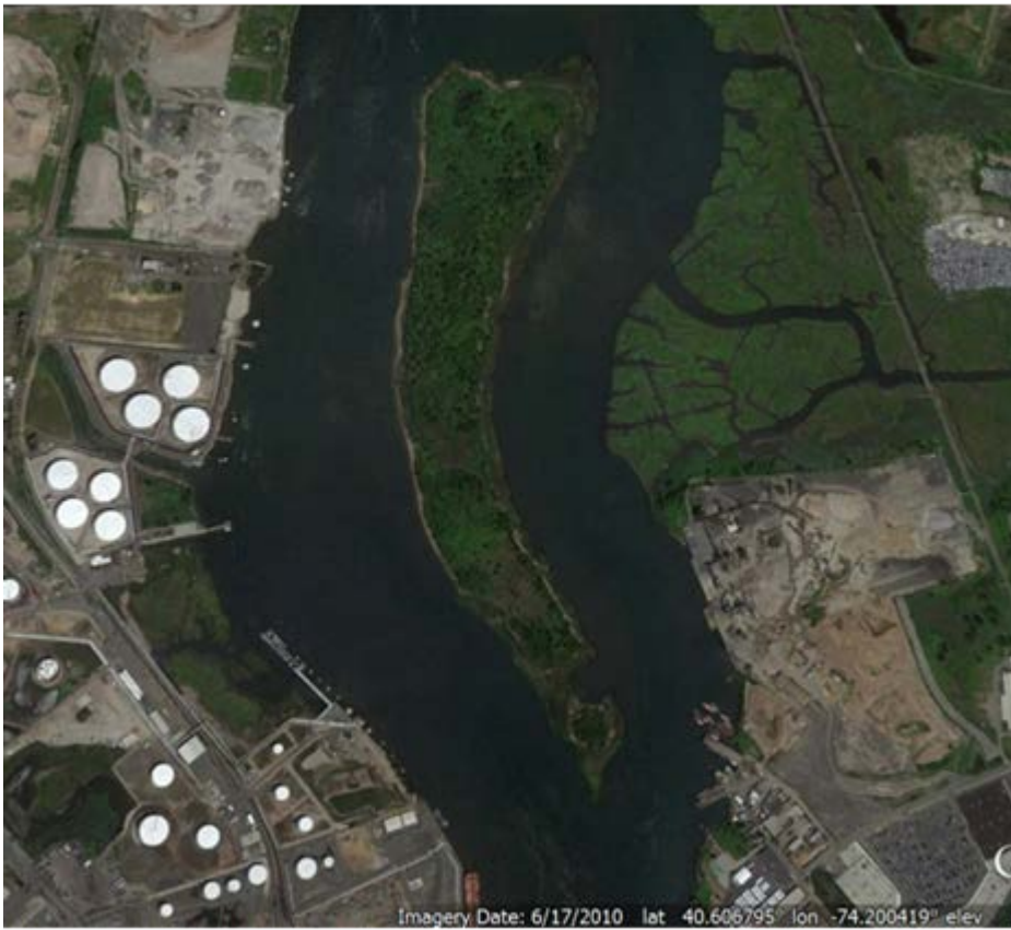
Figure 1. Map of Prall's Island. Google Earth image from 2010. Prall's Island is situated in the Arthur Kill, between Linden New Jersey and Staten Island, New York.