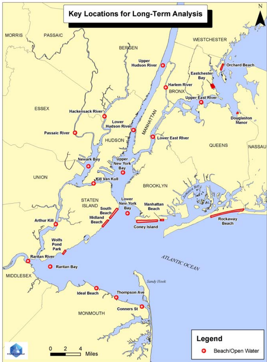
Figure 2 Key Locations